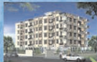
Vardhman Apartments, Banipark