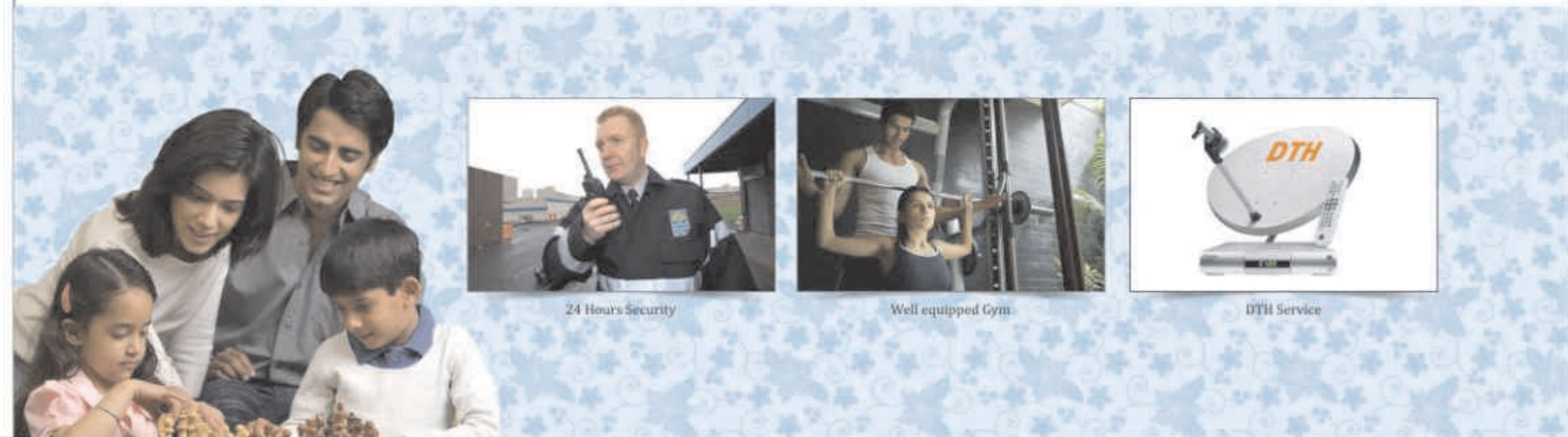
24 Hours Security