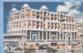
Crossroad, Vidhyadhar Nagar