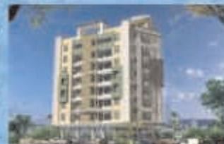
Western Heights, Shyam Nagar