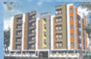
Arihant Enclave, Ajmer Road