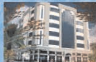
Amrapali Plaza, Vaishali Circle