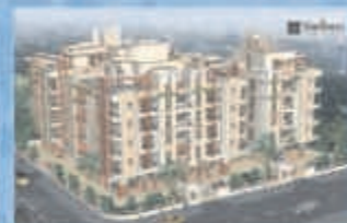
Vardhman Residency, Ajmer Road